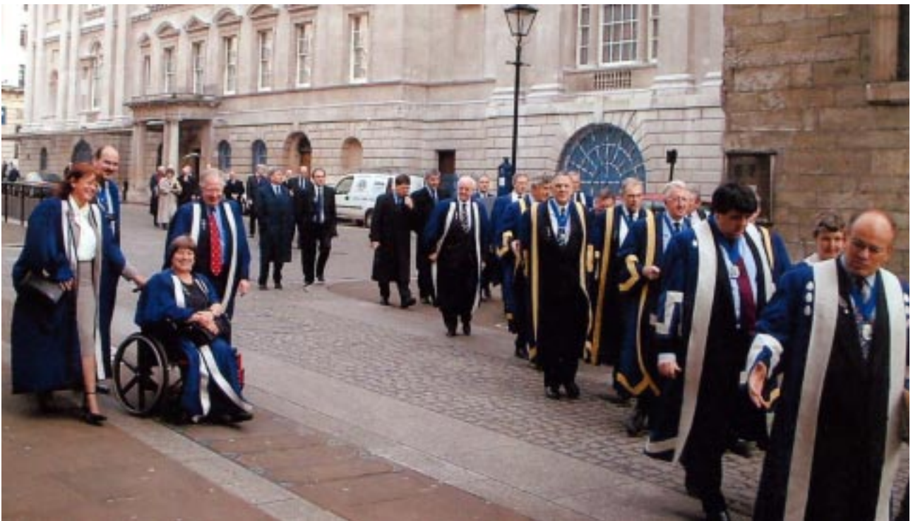
Court procession passing down Walbrook