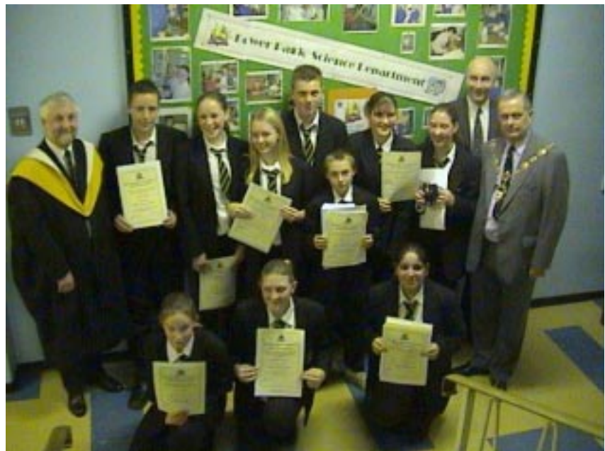
Bower Park School Prize Winners

The Company is now focused on developing its role to follow the best traditions of the Livery. A large part of that role has historically been to support education and training, and our new livery company is keen to play its part, whilst at the same time promoting water conservation in its widest sense.