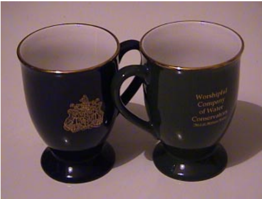
Water Conservator's Goblets.

When the pilot study is completed, it is intended to launch it Company and country wide, and invite members of the livery to become a School Water Conservators, and for them to develop a link with a school in their locality, or a school with which they or their family are associated.