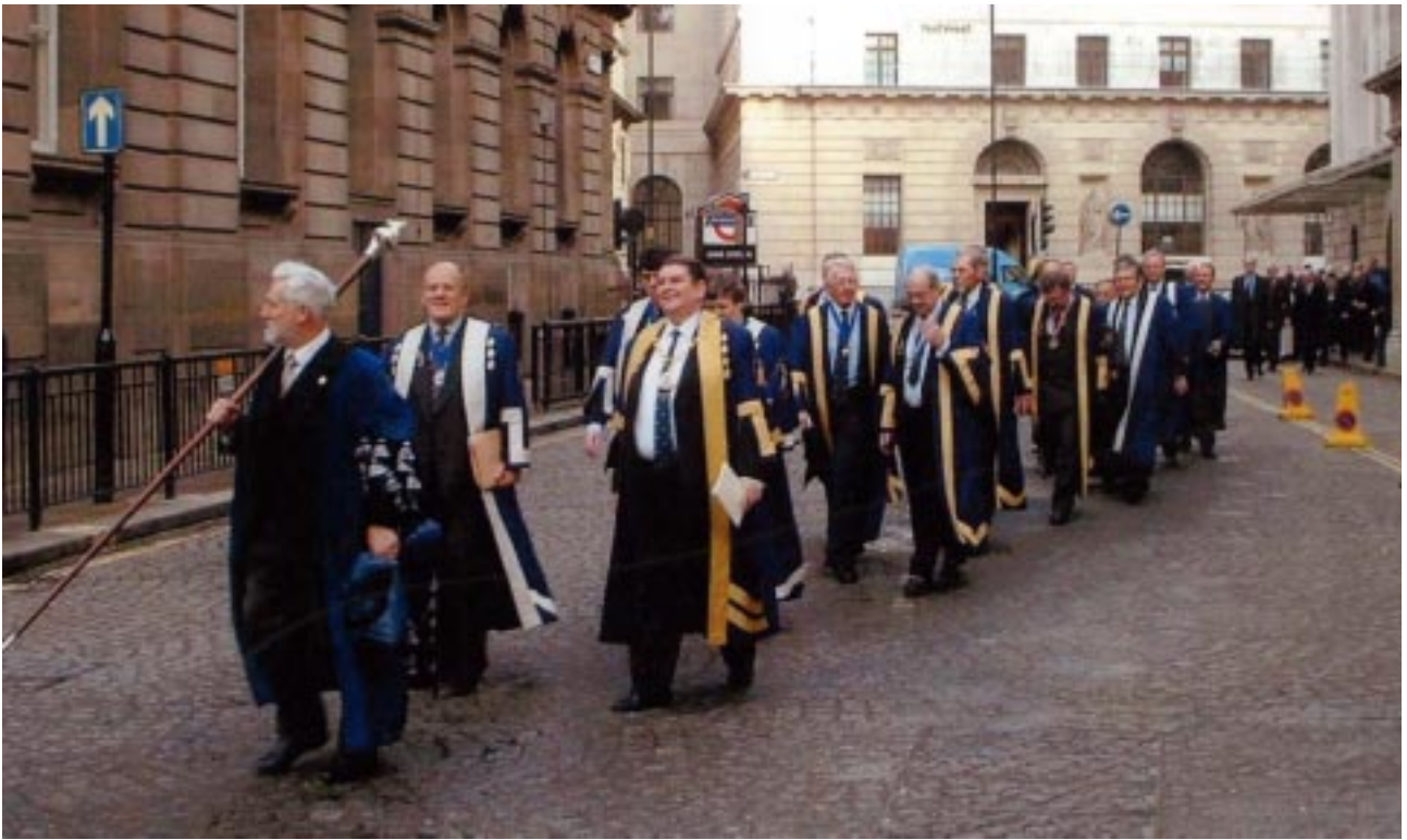
Court procession passing the Mansion House