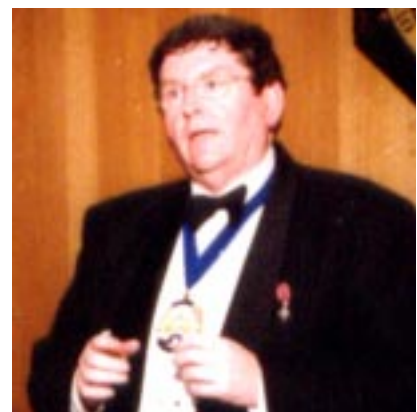
Master replying on behalf of the Company

At the conclusion of the dinner the assembled throng were required to sing the Grace, Laudi Spirituali, accompanied by the musicians. Our excellent Beadle thankfully took it upon himself to be our conductor. If this procedure is to be continued then the Company must consider providing the Beadle with a conductor's baton, his mace is a little unwieldy for this purpose. Clearly no-one had thought of carrying out a risk assessment on behalf of the top table. We must also try to improve the quality of the singing.