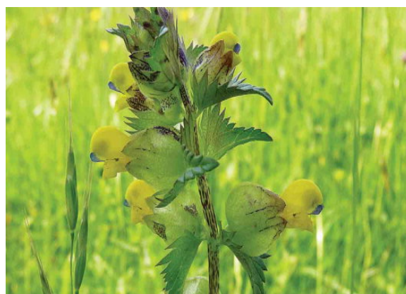
Yellow rattle Rhinanthus minor , (Royal Botanic Gardens, Kew)

The WCT makes small contributions for expenses relating to environmental research. Yellow rattle is a grass parasite, moderating grass growth and leading to greater biodiversity. It is controlled by summer mowing which removes the flowers.