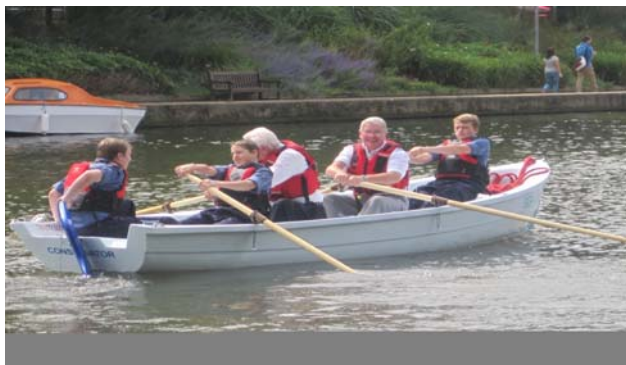
Demonstrating moderate prowess, the Water Conservators team heads towards Maidstone Bridge.

The sea-going performance was thoroughly tested