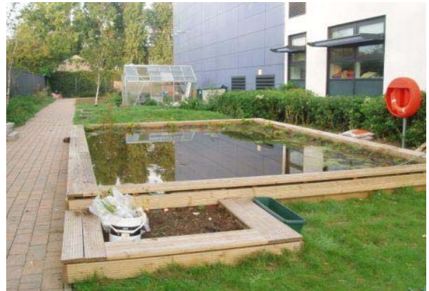
Ruislip School pond before planting-in 2010

More recently, the Company has planned and constructed a pond at Ruislip School. The funding of this project has been partly donated labour and materials via the Company and the AIDU at RAF Northolt, and partly from donations from the WCT and other local charities. Trustees managed the project and handed it over to the school in 2010.