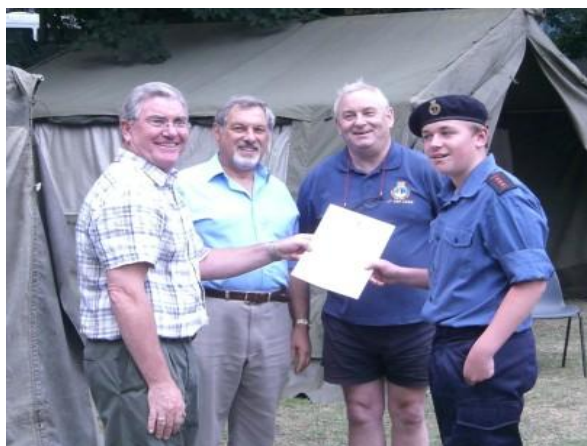
Maidstone Sea Cadets - award ceremony, August 2010.