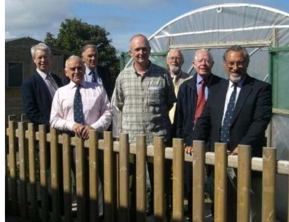
WCT Trustees and school staff on a site inspection at Ysgol-y-Gogarth in Sept 2010.

Trustees are actively involved in the projects, supported by Company representatives and volunteers. Individual grants are small and the trustees are particularly interested in a strong multiplier effect and replication.