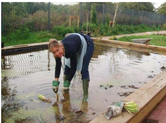
Ruislip School pond - planting out, August 2010

The project started after a collection at a Company lunch of just over £500. This has triggered financial contributions from others (apart from gifts in kind) in excess of £2,000 (including £500 from the WCT for the cost of security equipment).