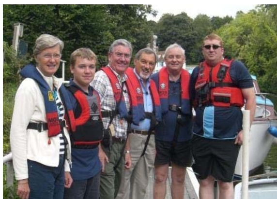
Maidstone Sea Cadets -August 2010.

The guests, suitably attired, were also treated to a delightful voyage along the River Medway and a great time was had by all.