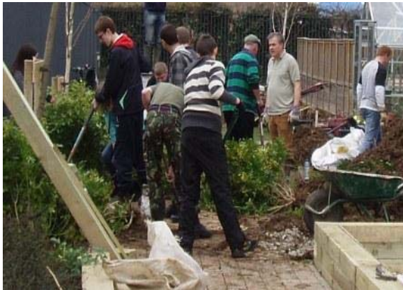
Ruislip School - a hive of activity in Spring 2010

An under-utilised area at the school has been transformed into a valuable ecological resource to supplement class-room teaching. It now provides an excellent introduction to the natural world for all children, particularly for those with special needs.