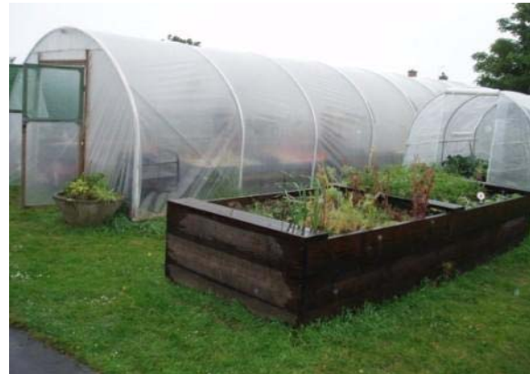
Ysgol-y-Gogarth - "the start" in 2008.

The WCT's annual grant, together with Company Members' personal support, has led directly to further funding and others getting involved.