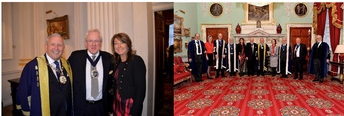
The Master, Lord Mayor and Master's Consort, and Wardens, Clerk, Beadle, partners and principal guests