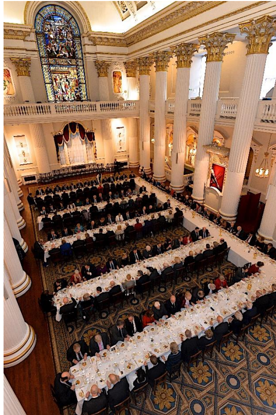
The Egyptian Hall, Mansion House, and 170 Water Conservators and guests.

Following on from the loyal toast and a toast to the Lord Mayor, the Master took the opportunity to welcome the guests and explain what a unique Lord Mayor we have this year – he comes from an unusual background being both an accomplished musician and teacher. Prior to proposing a toast to the guests, the Master presented the Lord Mayor with a cheque for £1,000 in support of his three charities for the year, and a leather covered copy of the Company's recently published History for the Period 2000-2015.