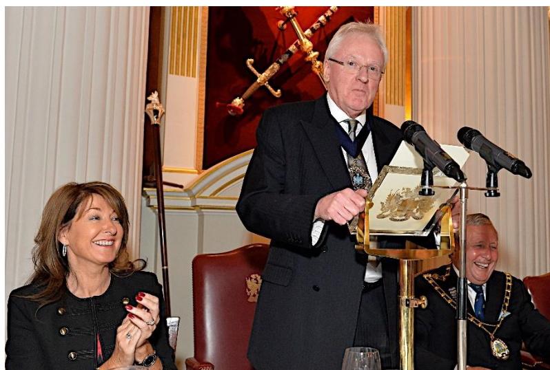
The Lord Mayor delivering his response with typical (for this Lord Mayor at least) humour.

Following on from the loyal toast and a toast to the Lord Mayor, the Master took the opportunity to welcome the guests and explain what a unique Lord Mayor we have this year – he comes from an unusual background being both an accomplished musician and teacher. Prior to proposing a toast to the guests, the Master presented the Lord Mayor with a cheque for £1,000 in support of his three charities for the year, and a leather covered copy of the Company's recently published History for the Period 2000-2015.