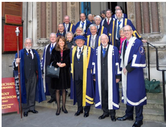
The Master, Wardens, Clerk and Beadle at the entrance to St Michael's, Cornhill