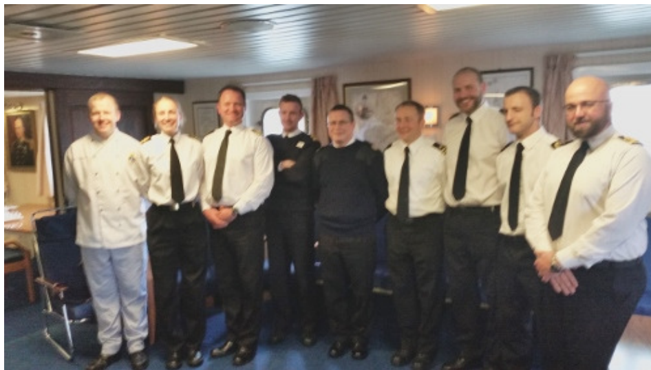
(above) Officers of HMS Scott

In the evening, drinks and an excellent dinner were taken in the Scott's wardroom with the ships officers providing a very convivial venue for hearing more about the ship and exploits in Antarctica and other regions of the world. This opportunity was especially appreciated as the ship normally spends some 300 days of the year at sea and opportunities to meet up are few.