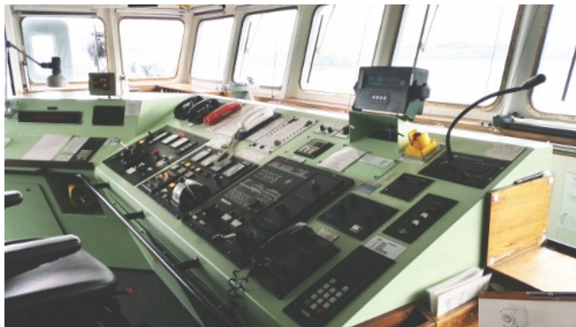
(left) The Bridge with speed and rudder controls

Lunch was taken on board and farewells and thanks made.